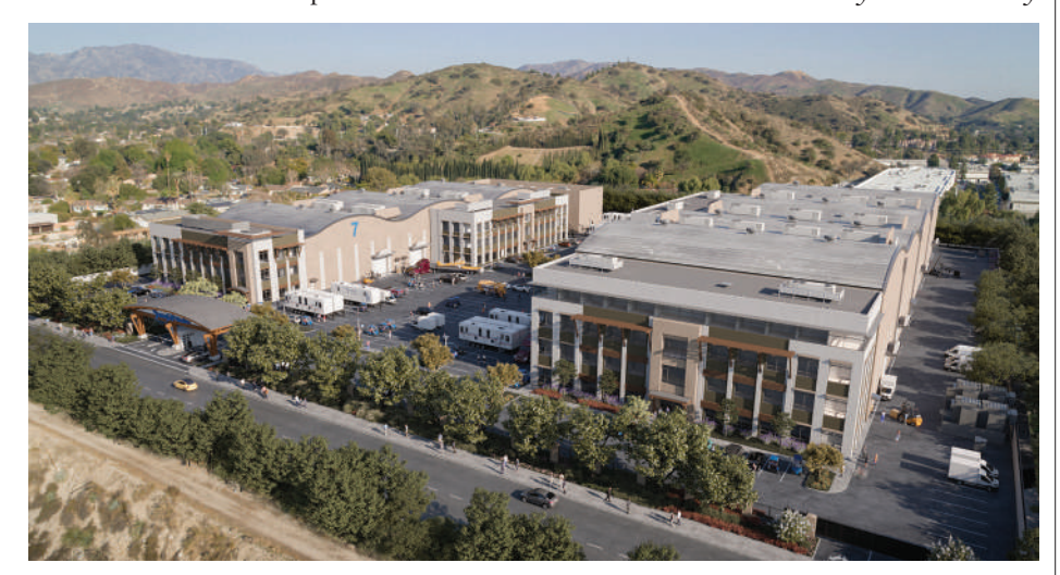
NEW ERA Movie studio construction was sparked by state incentives for California's film and TV industry.

The NAIOP CRE Sentiment Index for September 2021. The sentiment is based on a 100-point scale. Its current position above 50 indicates that respondents expect favorable conditions for commercial real estate over the next 12 months. The Index is higher than at any point since the COVID-19 pandemic began and has returned to the level observed in March 2019.