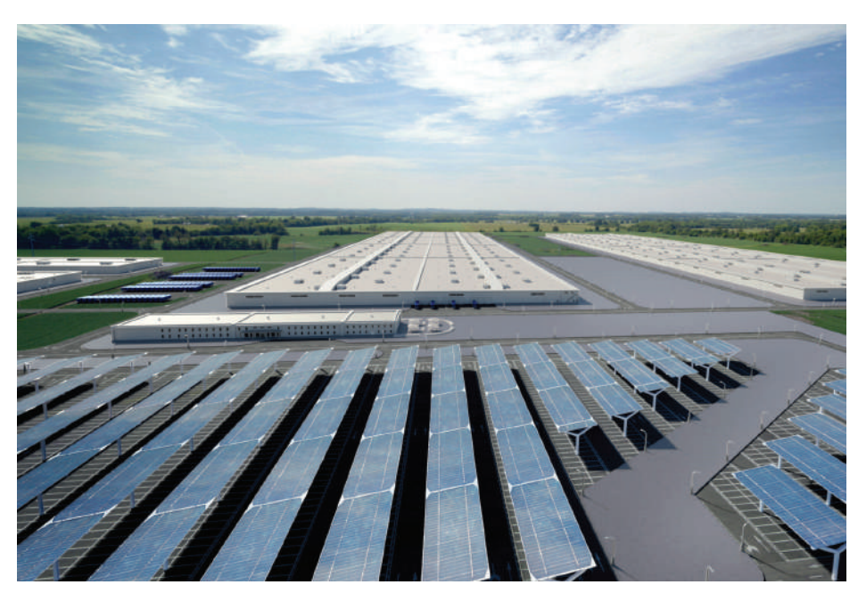
ELECTRIFIED Ford and SK Innovation plan to spend $5.8 billion building two EV battery plants in Glendale, Ky.