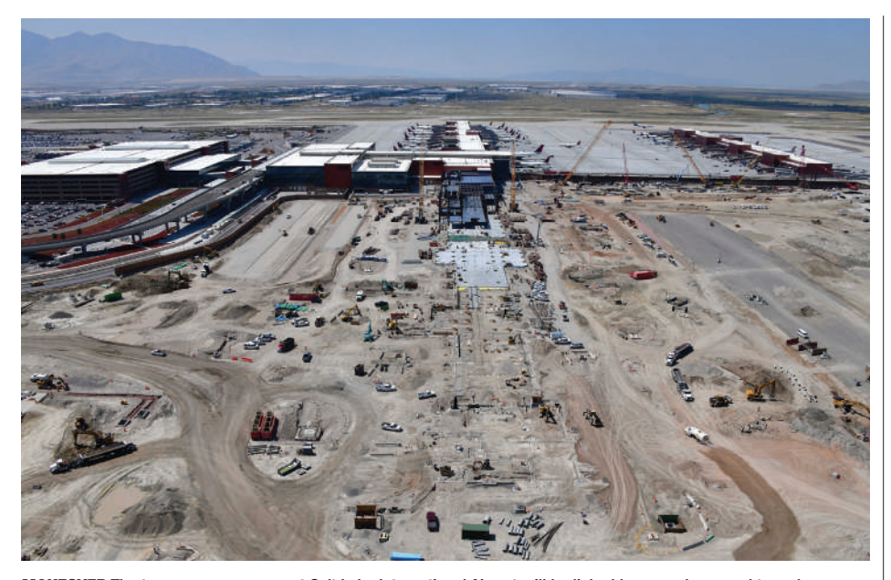
MAKEOVER The two new concourses at Salt Lake International Airport will be linked by an underground tunnel.